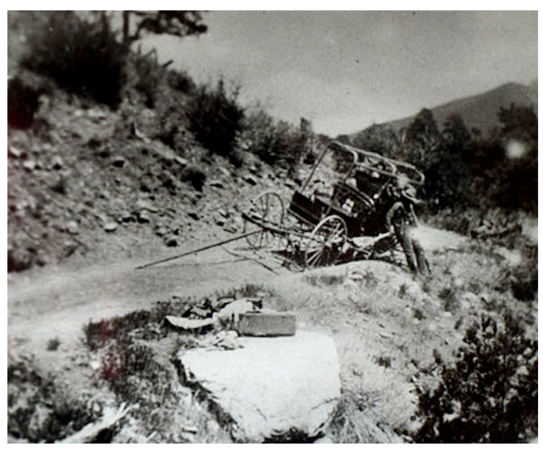
The broken wagon wheel that started it all.

Eureka! They had found exactly what they were looking for: that incredible light, an endless horizon with its blue skies, captivating clouds, stunning sunsets, the majestic, mysterious mountains, the rolling, frolicking Rio Grande, and picturesque Native and Hispanic cultures. Phillips settled in Taos, but Blumenschein returned east. Phillips said to Blumenschein, "For heaven's sake, tell people what we have found! Send some artists out here. There is a lifetime's work for twenty men."