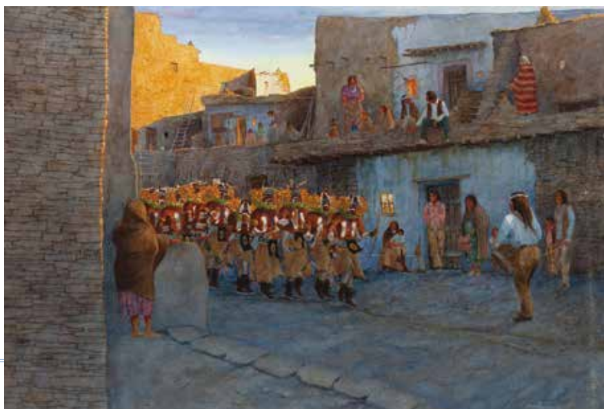
David Halbach, Pueblo Dance - Lagan Ceremony , 1968, watercolor, 20 x 30". Private collector. Estimate: $3/5,000