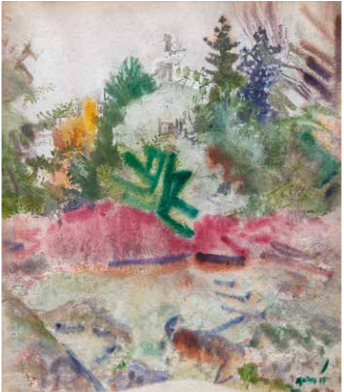
John Marin (1870-1953), Autumn in Mist , 1918, watercolor, 19¼ x 16¼". Private collection. Estimate: $15/30,000

with the individuals in these fields will be essential in garnering the market attention this influential group of American artists deserves."